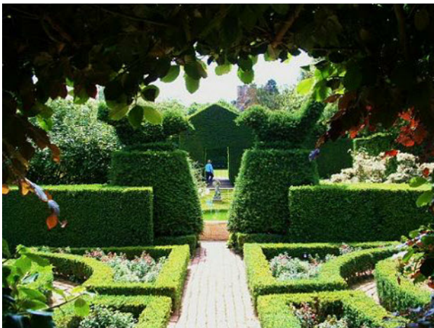
Hidcote Manor Garden