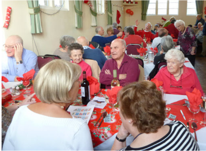
Christmas Lunch 2015