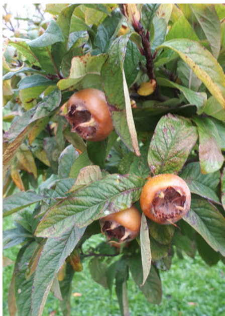
Big beautiful Medlars ripening

All that we do now makes sure we have fruit next year so it is really important.