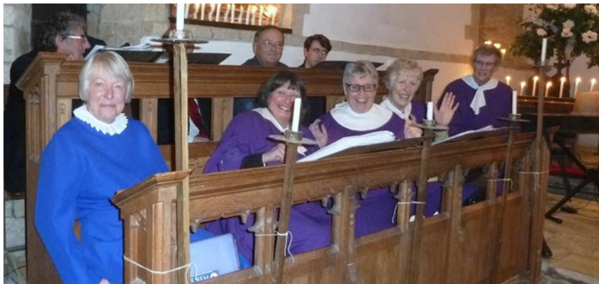
St Lawrence Church Carol service in 2013