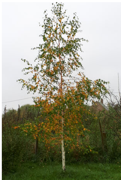
Silver Birch in the Windbreak