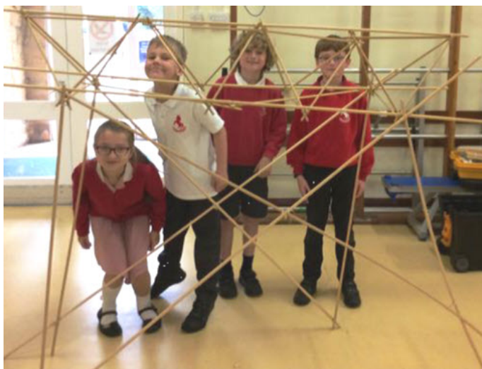
Building Bridges in the Architect Project